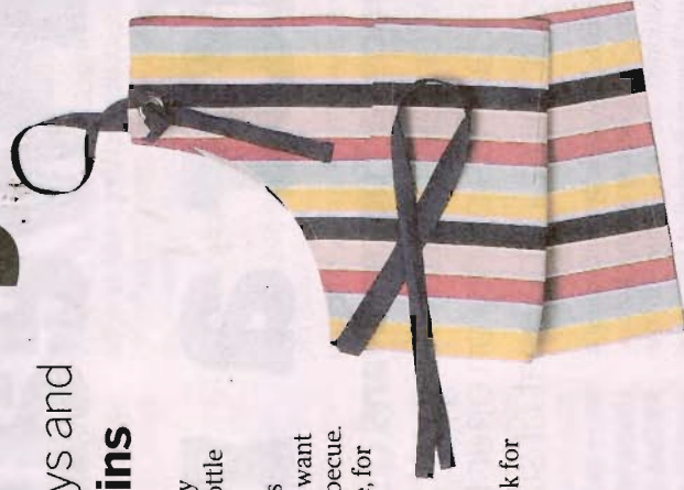
Sunnylife multi stripe apron $29.95 . www.sunnylife.com.au