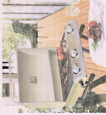
Black & Stone electric convection barbecue $599 . www.blackandstone.com